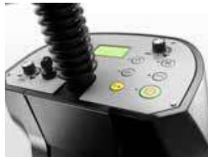
One touch start activates all main functions