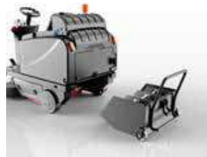
Wheeled hopper with optional mini containers