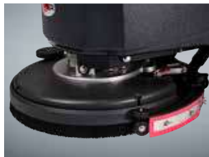
Tool-free removal and assembly of squeegee simplifies maintenance