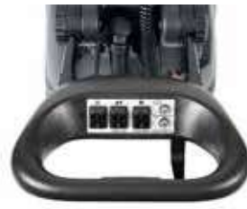
Ergonomic and adjustable handle