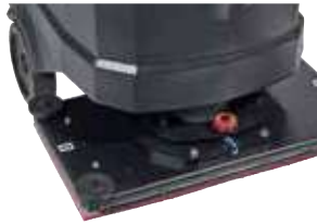
Orbital scrubber for floor cleaning or coat stripping (AS7190TO)