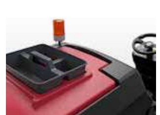
Easy-access debris tray