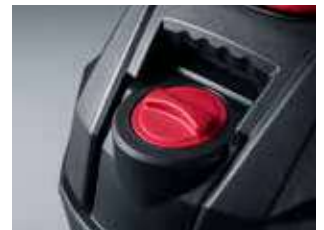
Convenient front access to solution tank for quick refills