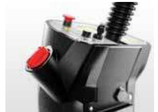
Remove the red cap and fill the solution tank with fresh water