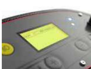
LCD heads-up display incl. hour meter