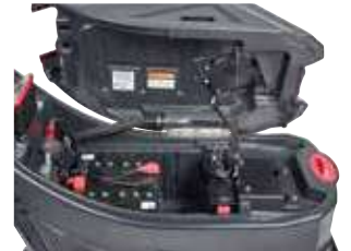
Recovery tank with hand grip for easy tilting