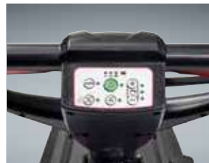
Intuitive control panel provides control over all functions (AS4325 model)