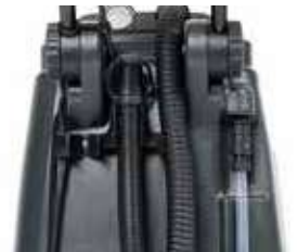
Drain hose for easy emptying