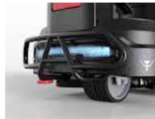
Sturdy bumper with high-visibility lights