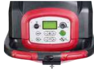
Intuitive control panel with LCD screen for all models (AS6690T/AS7690T pictured)