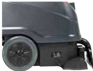
Large wheels for easy transport and manoeuvrability