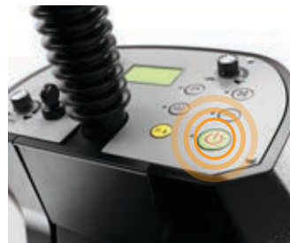
One touch start activates all main functions