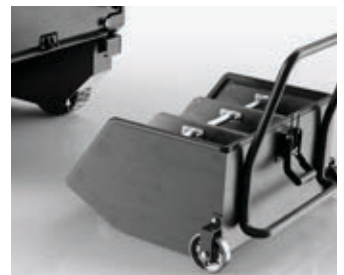
Wheeled hopper with optional mini containers