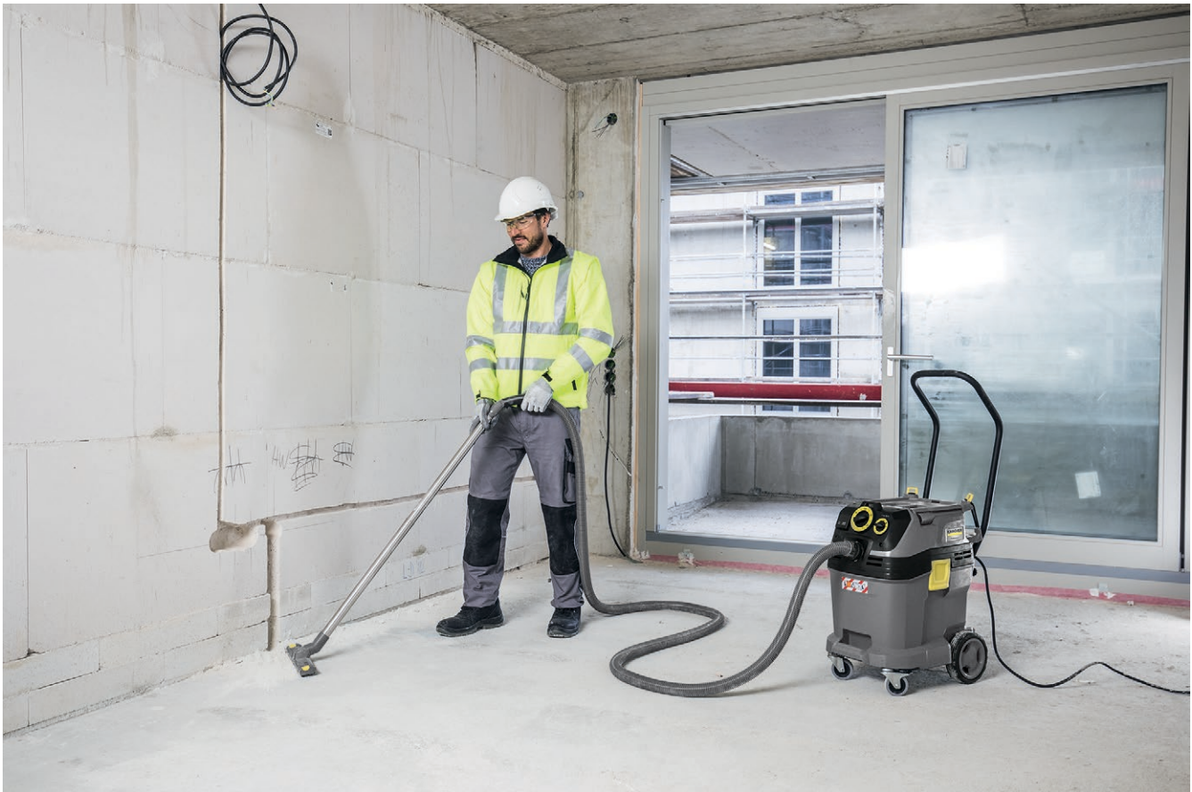
NT 40/1 TACT TE L *GB 240V