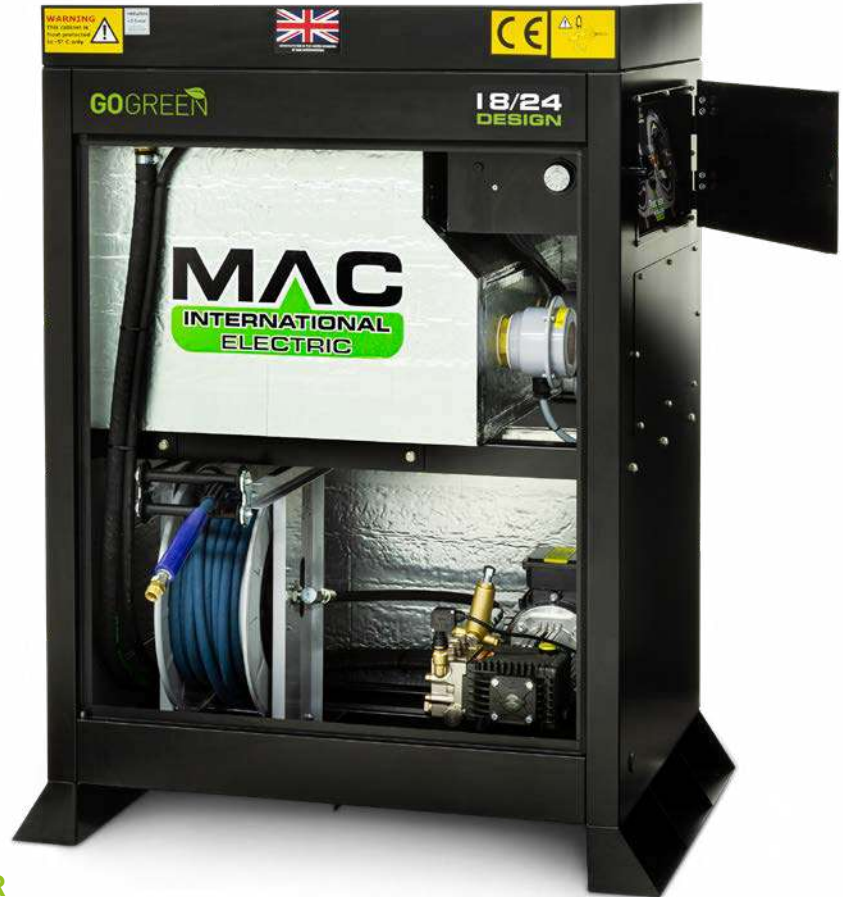
IMAGE SHOWS MACHINE FITTED WITH INTERNAL HOSE REEL OPTION