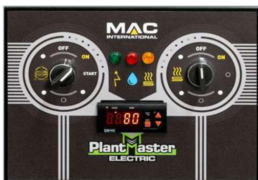
CONTROL PANEL & DIGITAL TEMPERATURE DISPLAY