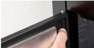
REMOVABLE HINGED FRONT DOOR AND LID

SEE PAGE 31 FOR ACCESSORIES AND OPTIONAL EXTRAS