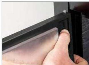
REMOVABLE HINGED FRONT DOOR AND LID

SEE PAGE 31 FOR ACCESSORIES AND OPTIONAL EXTRAS