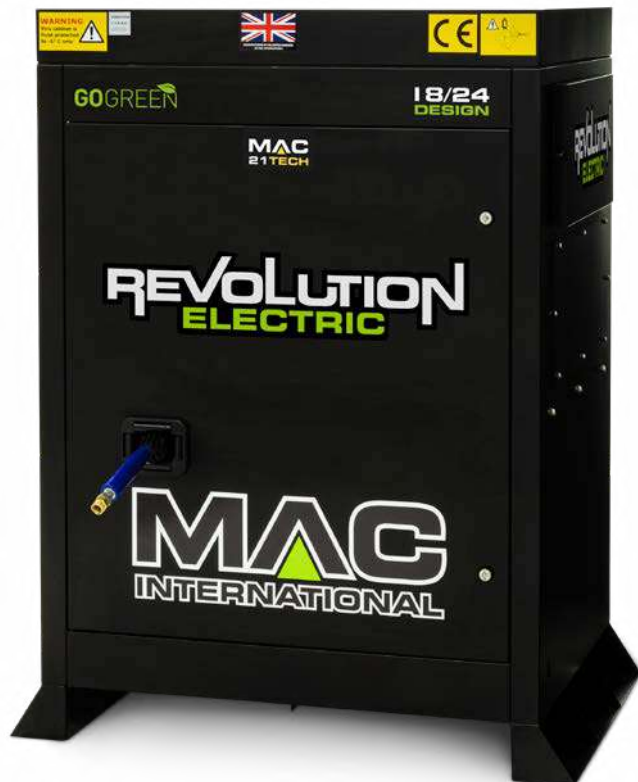
IMAGES SHOW MACHINE FITTED WITH INTERNAL HOSE REEL OPTION

THE MAC REVOLUTION ELECTRIC IS DESIGNED TO WORK ON A STANDARD 32AMP 400V SUPPLY. THE 170LTR WATER TANK ALLOWS SUPER FAST REHEATING AND HIGH RUNNING TEMPERATURES, UTILISING 24KW HEATERS FROM THE STANDARD 32AMP SUPPLY.