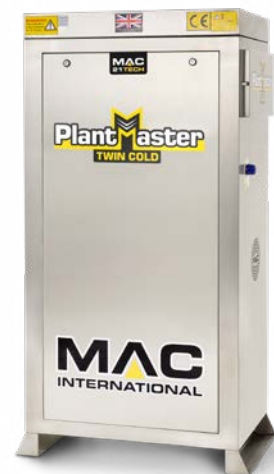
ALSO AVAILABLE IN A STAINLESS STEEL CABINET