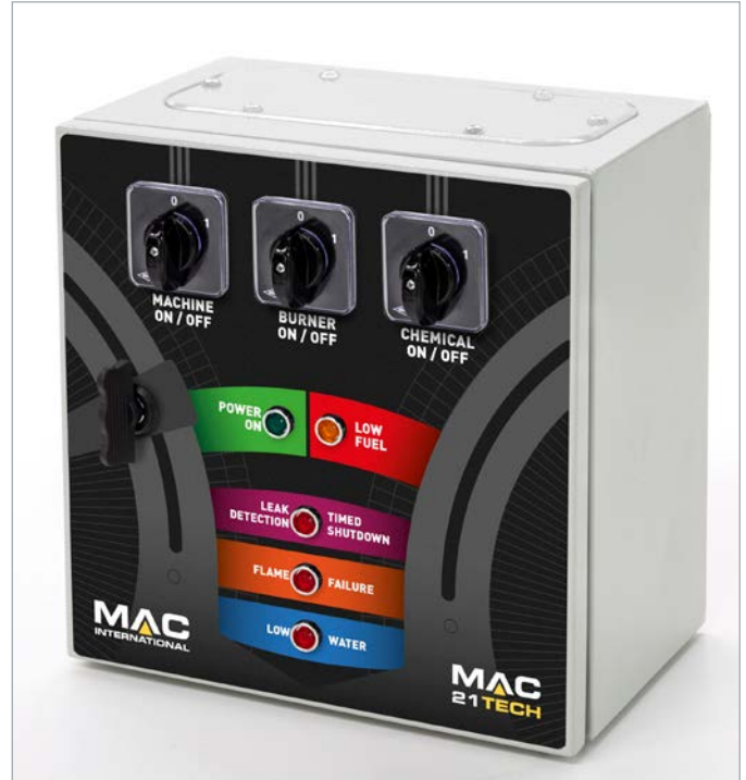
Introducing the new MAC Remote Control System which utilises 21TECH to mirror the machines functions and status indicators

Improved safety features are now standard on all machines and represent a huge step forward in pressure washing technology.