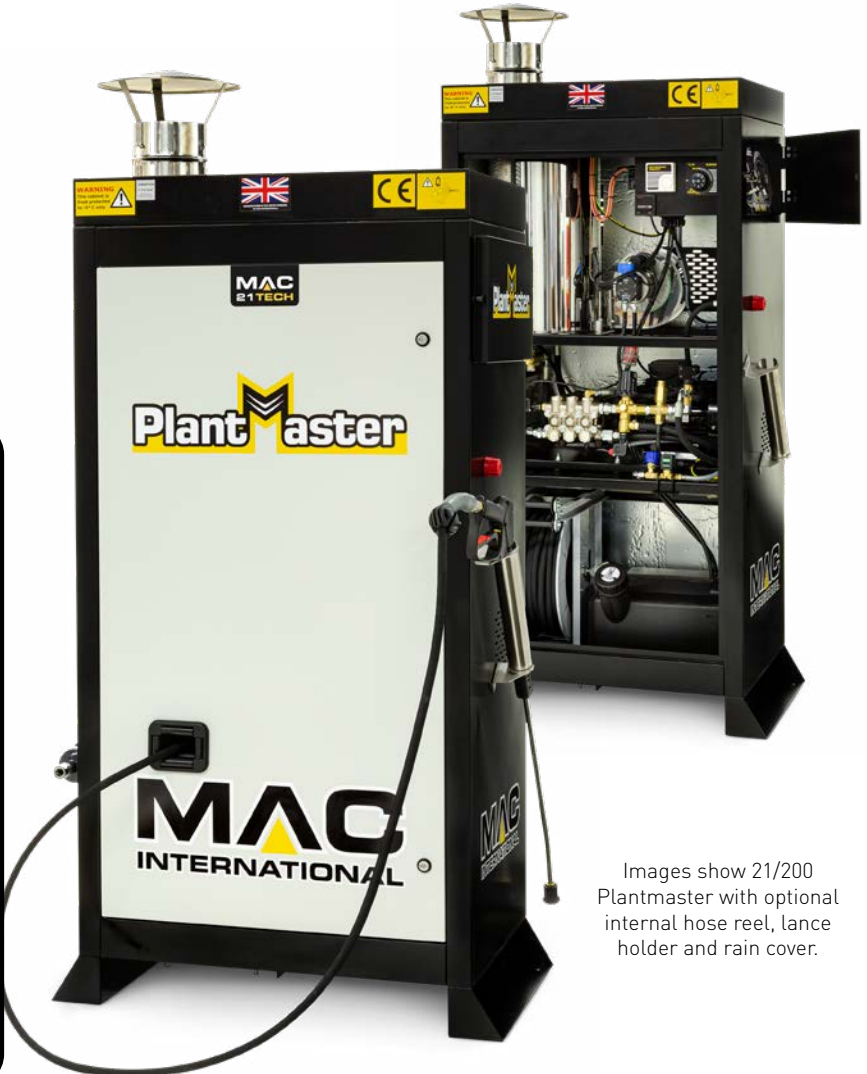
Images show 21/200 Plantmaster with optional internal hose reel, lance holder and rain cover.