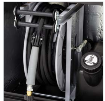
INTERNAL HOSE REEL