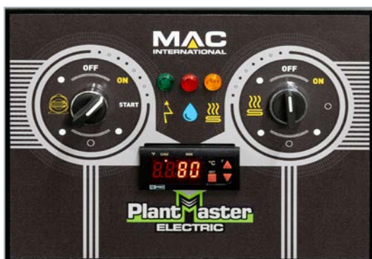
CONTROL PANEL & DIGITAL TEMPERATURE DISPLAY