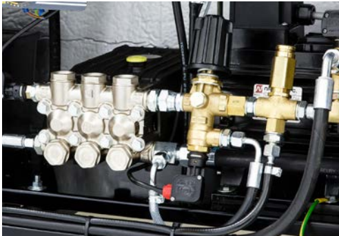
PROFESSIONAL INTERPUMP RANGE