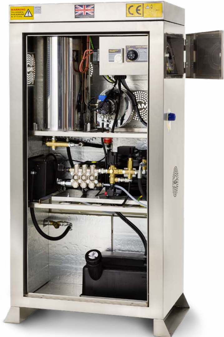
316L STAINLESS STEEL