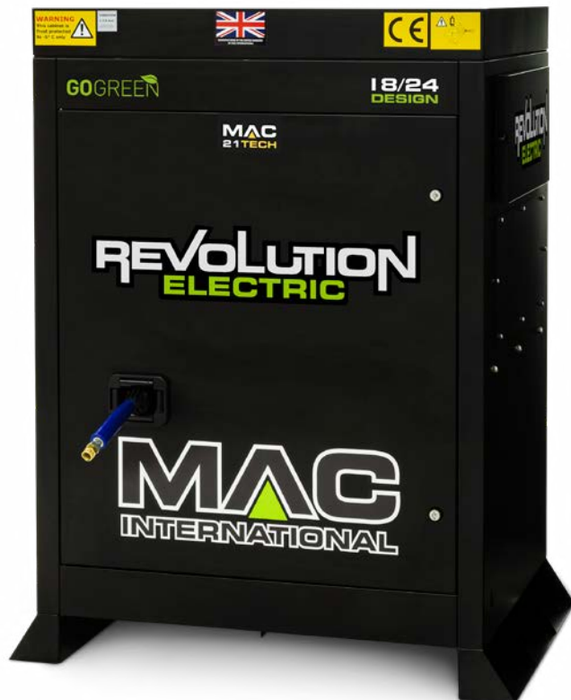
IMAGES SHOW MACHINE FITTED WITH INTERNAL HOSE REEL OPTION

THE MAC REVOLUTION ELECTRIC IS DESIGNED TO WORK ON A STANDARD 32AMP 400V SUPPLY. THE 170LTR WATER TANK ALLOWS SUPER FAST REHEATING AND HIGH RUNNING TEMPERATURES, UTILISING 24KW HEATERS FROM THE STANDARD 32AMP SUPPLY.