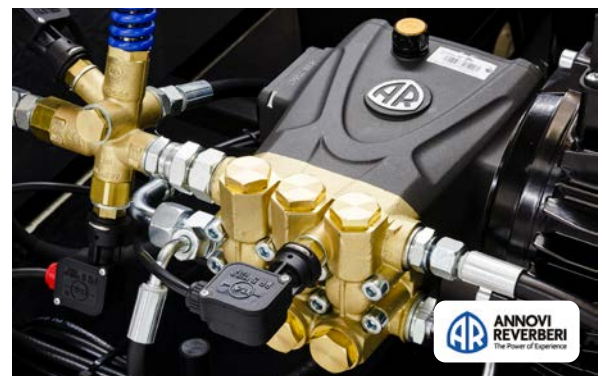
HIGH QUALITY ANNOVI REVERBERI PUMP