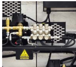
HIGH QUALITY INTERPUMP