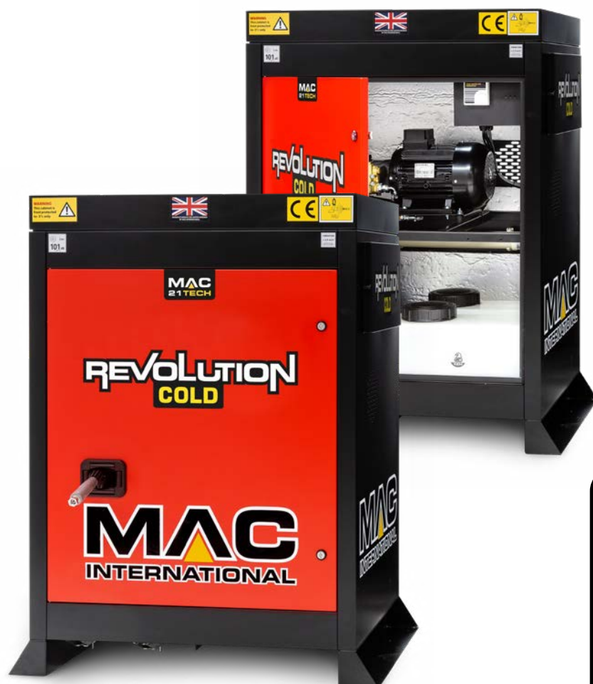
Image shows machine fitted with internal hose reel

THE MAC REVOLUTION COLD RANGE IS NOW AVAILABLE IN 10 VERSIONS OFFERING A GREAT CHOICE. MAC COLD STATICS ARE NOW EVEN MORE AFFORDABLE, BUILT WITH QUALITY COMPONENTS AND FULL OF KEY FEATURES SUCH AS FROST PROTECTION AND LEAK DETECTION.