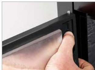
REMOVABLE HINGED FRONT DOOR AND LID

SEE PAGE 31 FOR ACCESSORIES AND OPTIONAL EXTRAS