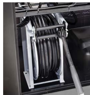
OPTIONAL INTERNAL HOSE REEL