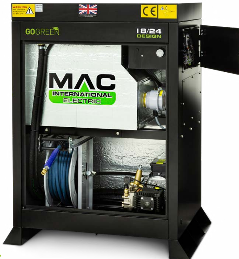
IMAGE SHOWS MACHINE FITTED WITH INTERNAL HOSE REEL OPTION