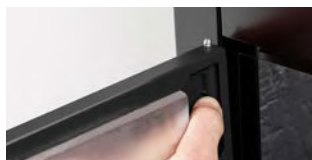
REMOVABLE HINGED FRONT DOOR AND LID

SEE PAGE 31 FOR ACCESSORIES AND OPTIONAL EXTRAS