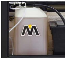
ADEQUATE SPACE FOR DETERGENT