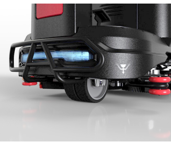
Sturdy bumper with high-visibility lights