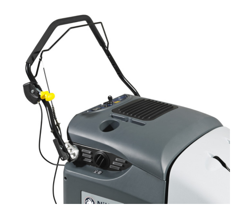
Convenient transport and storage: Handlebar completely foldable.