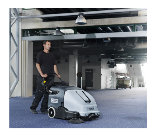
Removes even the smallest particles – also on carpet areas.