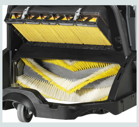
Time-saving maintenance: Broom change, and other maintenance tasks, can be carried out without tools