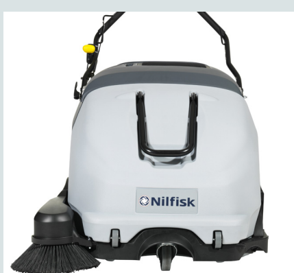
Good hygiene: Hands of user will only touch clean parts of hopper when dumping the debris.