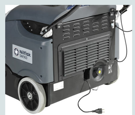
The battery version of Nilfisk SW900, for both in- and outdoor sweeping, has an onboard charger as standard