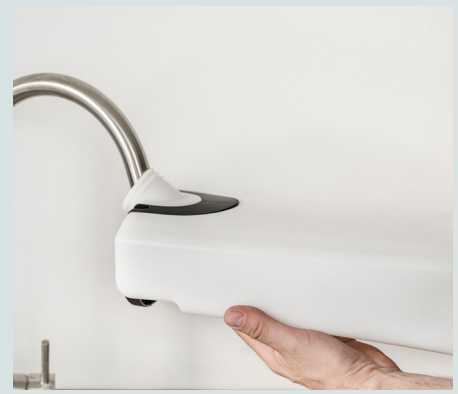
Easy to fill the solution tank with water even in a low sink