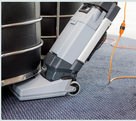
Low deck profile (25cm) and offset allows cleaning in difficult to reach areas