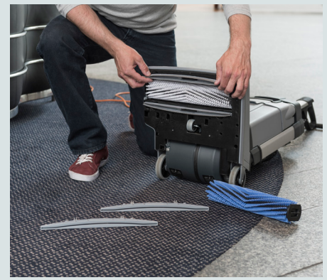
Apart from getting faster cleaning of hard floors, you will also be able to freshen up smaller carpets, including removal of spots, by adding an optional carpet kit. Brush and squeegees can be removed without any tools making daily maintance operations easy and fast