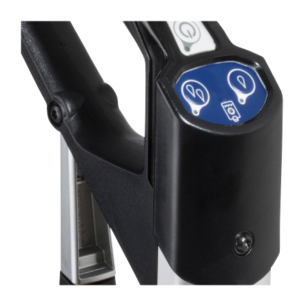
You will remain in full control of the scrubber dryer thanks to the intuitive touch display with two water settings and a solution indicator, alerting you if the tank is empty