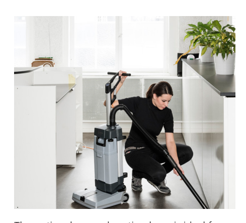
The optional manual suction hose is ideal for cleaning any unreachable area or spot cleaning