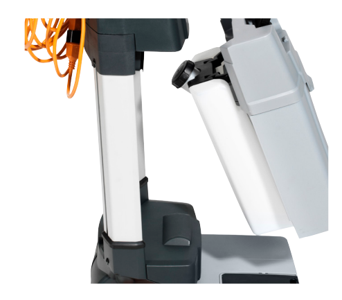
Each tank can be removed quickly and carried in one hand