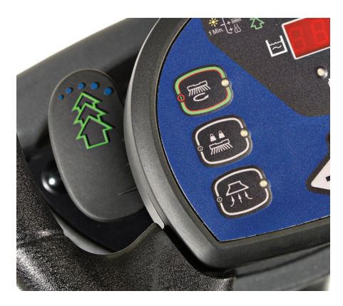
One paddle activates & de-activates the Ecoflex system