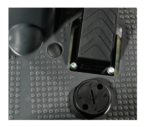
Fully adjustable traction pedal can be aligned with the operators choice of driving position