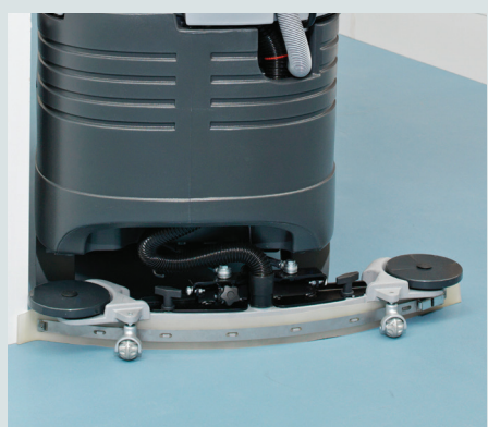
The squeegee does not swing, (it moves only when hitting obstacles) so it perfectly follows the deck/water track and guarantees complete water pick-up, even on tight turns, without leaving a trace