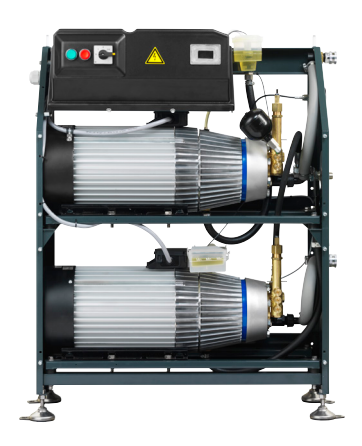
Cabinet can be removed quickly for direct access to the motor pump