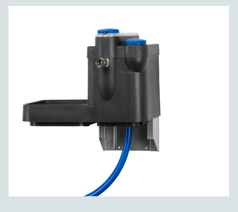
External Water Break Tank for up til 40 ltr/min.