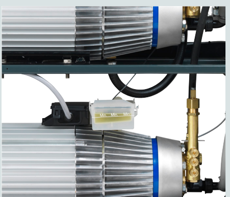
Pump oil tank with oil level sight and fill/empty function