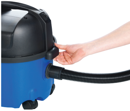
The robust latch system makes it easy to open for changing the dust bag.