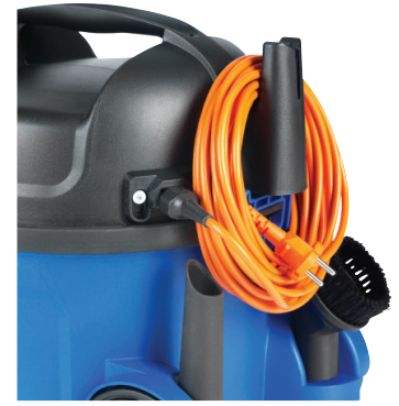
Detachable orange cord and cord hook for controlled storage.